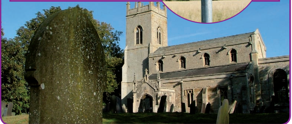
All Saints', Hougham