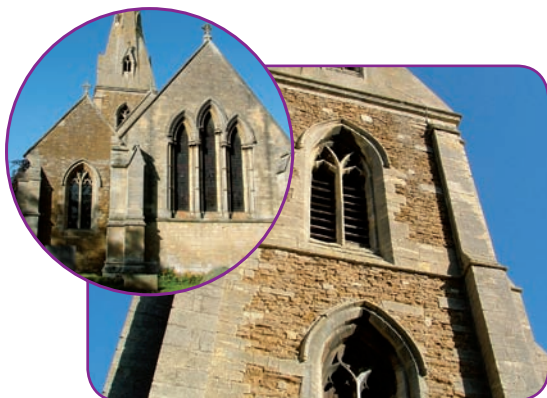
St Mary's, Marston

This leaflet has been produced in partnership with Marston Parish Council