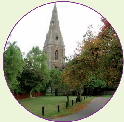
St Mary's, Marston